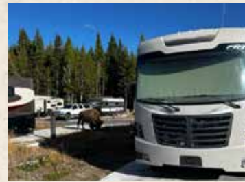
“Buccalo” visiting our campground