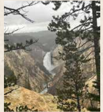
View of Lower Falls, Grand Canyon of the Yellowstone