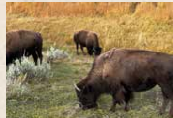
Bison or ‘Buccalo’ according to my grandson