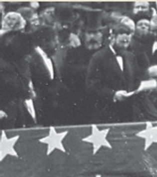
Grant's inauguration - first term